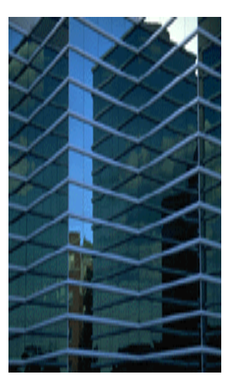
"We believe in performing to the best of our abilities and in giving the customer more than what they asked for originally, "

Permint Engineering Sdn Bhd is a Terengganu state SEDC subsidiary company in Terengganu, involved in metal fabrication of steel structures, vessels and piping for the local oil and gas industry. SunpacPlus® Enterprise was installed replacing the older DOS-based system in a project worth