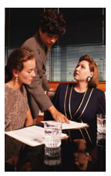
"SunpacPlus© HR & Payroll Manager is a comprehensive human resource and payroll solution that covers HRMIS processes from Recruitment to Termination."